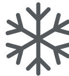
Freeze Thaw (Pending Testing)